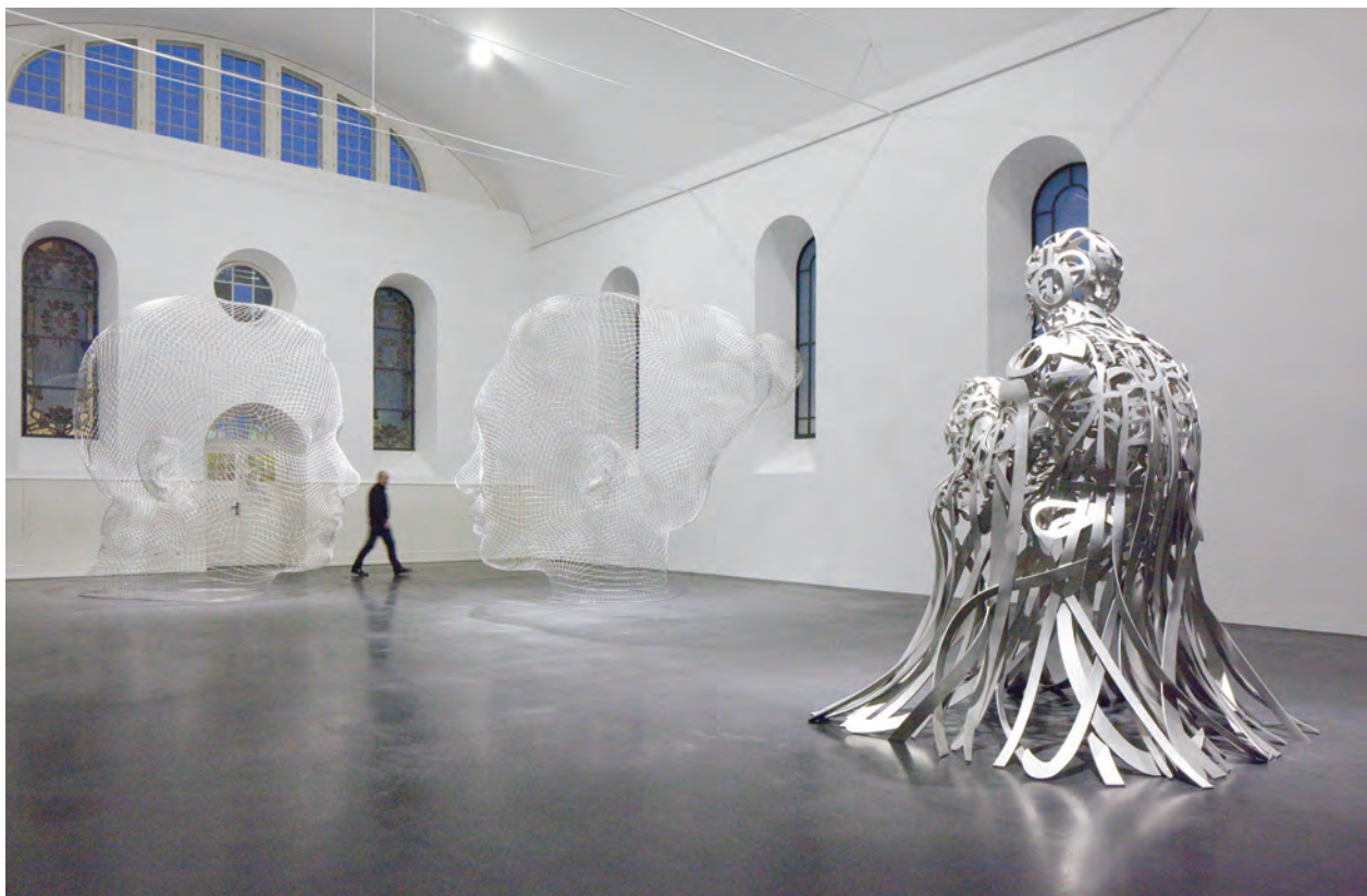
Jaume Plensa – exhibition in the Jakobshallen art space of Galerie Scheffel